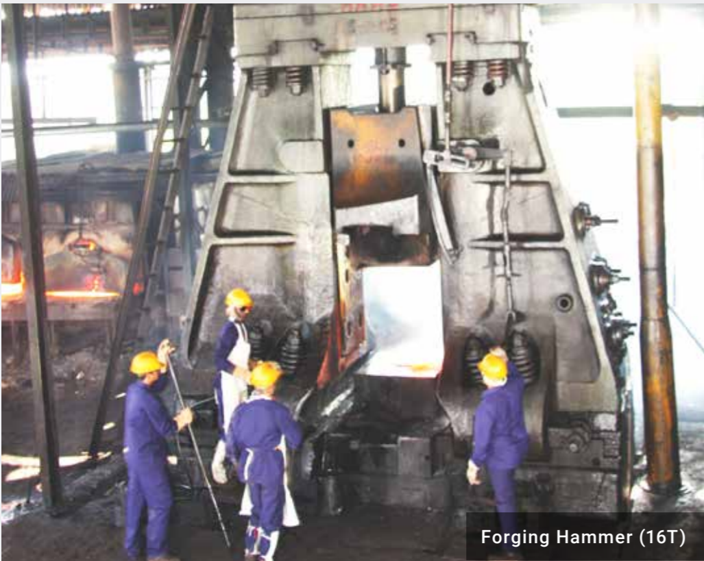
Forging Hammer (16T)