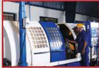
CNC JOURNAL MILLING