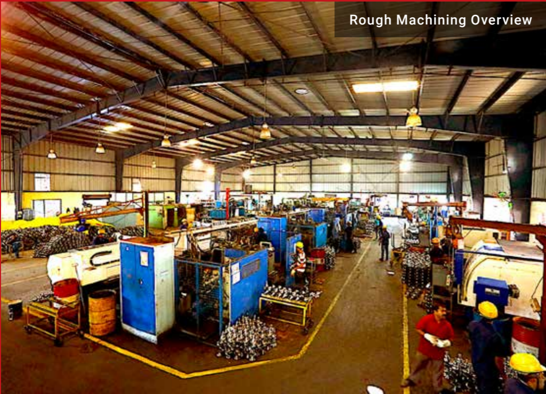
Rough Machining Overview