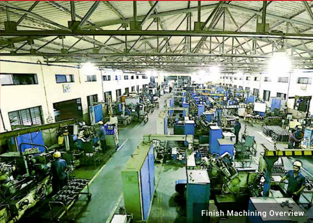
Finish Machining Overview