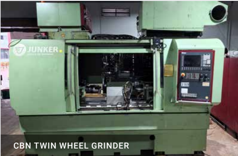
CBN TWIN WHEEL GRINDER