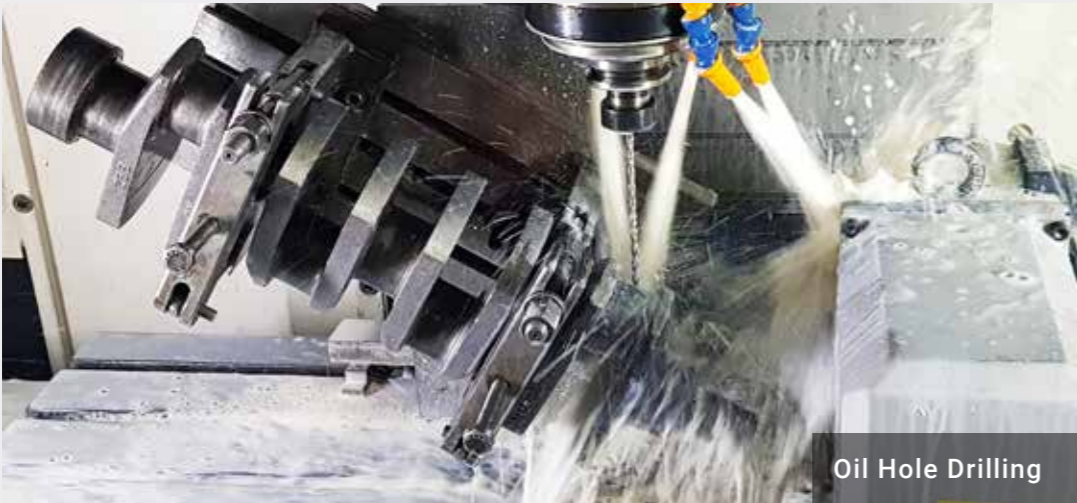
Oil Hole Drilling