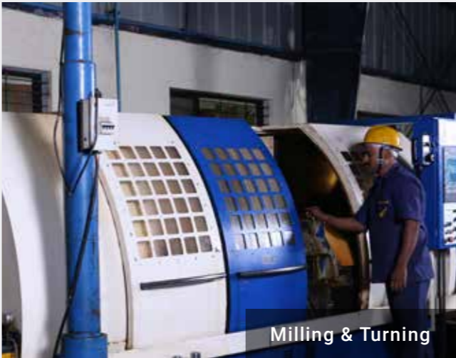
Milling & Turning