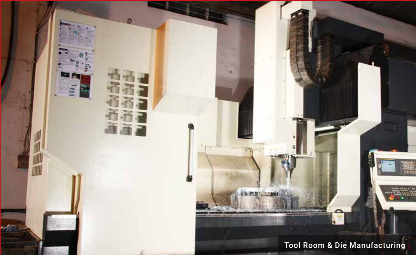
Tool Room & Die Manufacturing