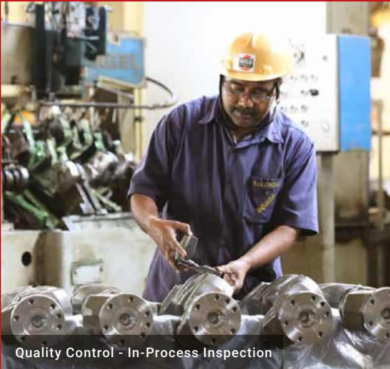
Quality Control - In-Process Inspection