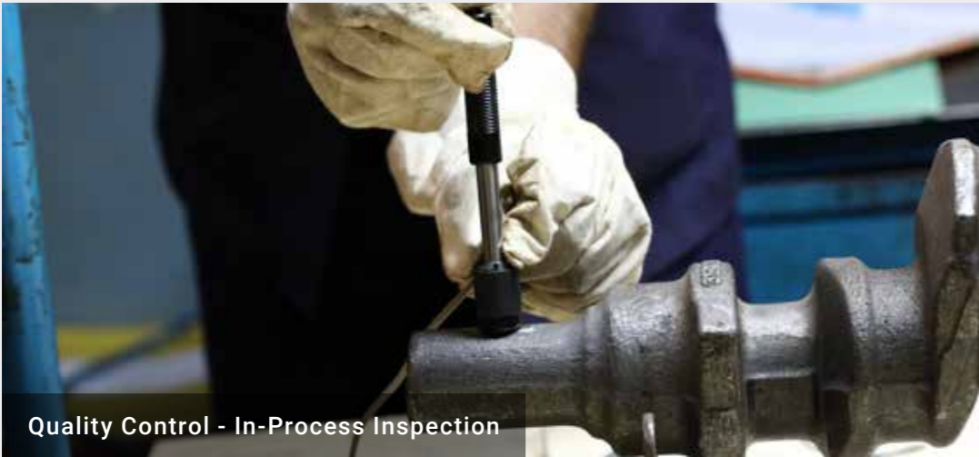
Quality Control - In-Process Inspection