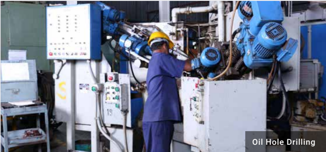
Oil Hole Drilling