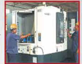
POST GRINDING OPERATIONS: FLANGE HOLE GEAR END & TAPPING