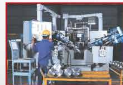
OIL HOLE DRILLING