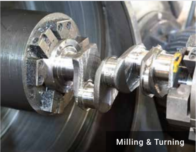
Milling & Turning