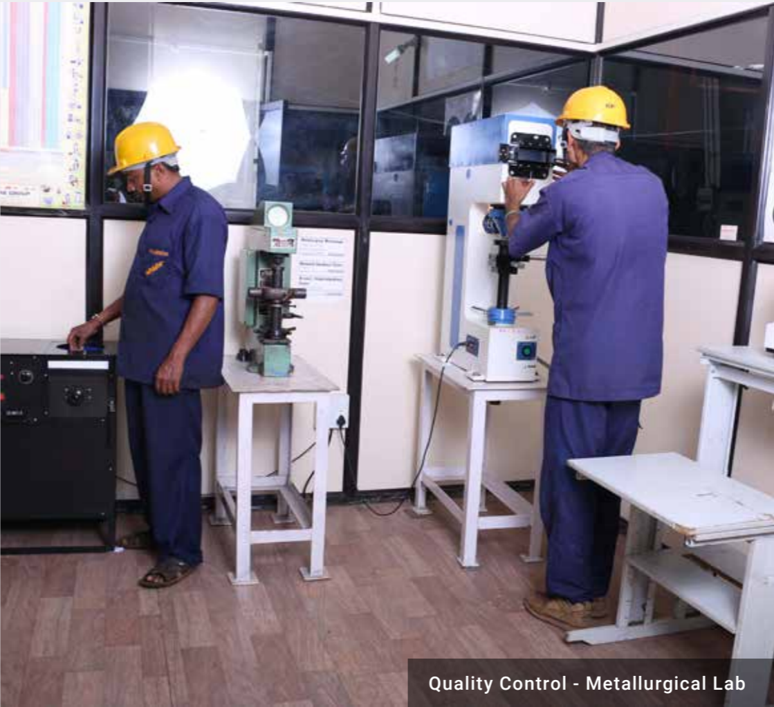
Quality Control - Metallurgical Lab