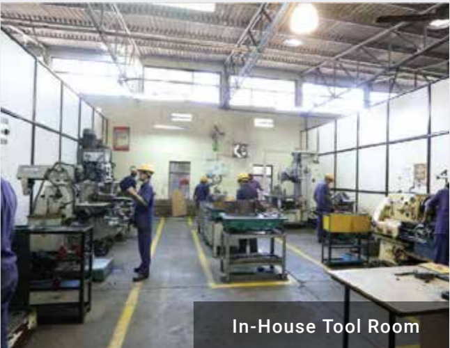
In-House Tool Room