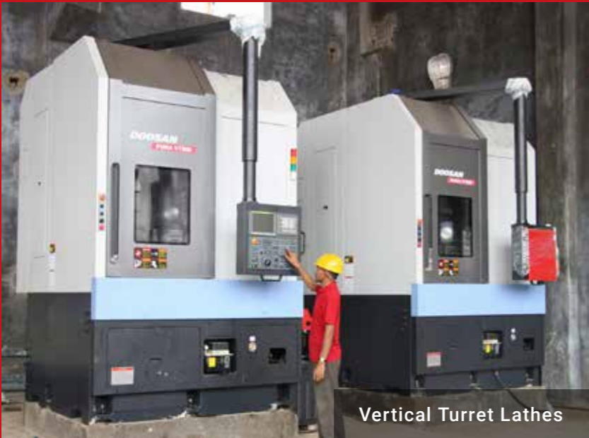
Vertical Turret Lathes