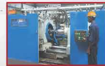
HELLER PIN MILLING