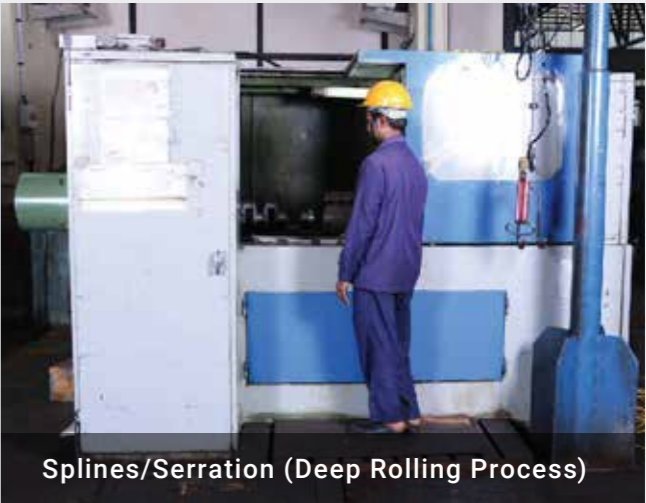
Splines/Serration (Deep Rolling Process)