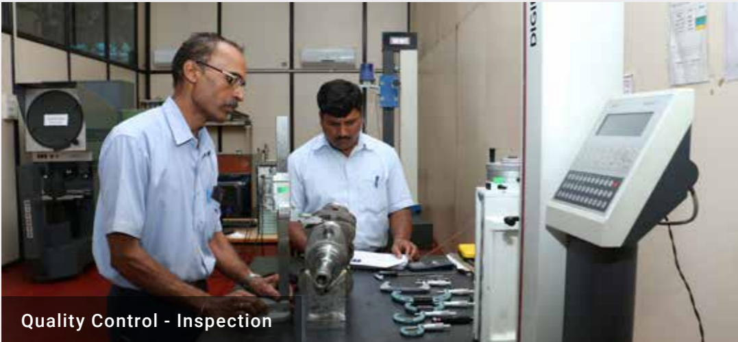
Quality Control - Inspection