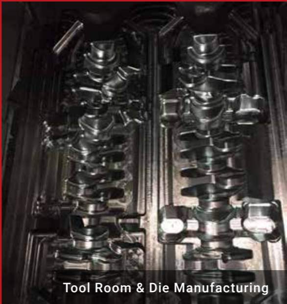
Tool Room & Die Manufacturing