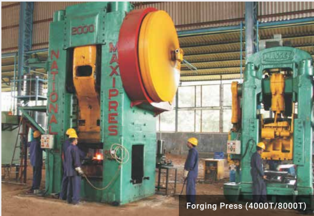
Forging Press (4000T/8000T)