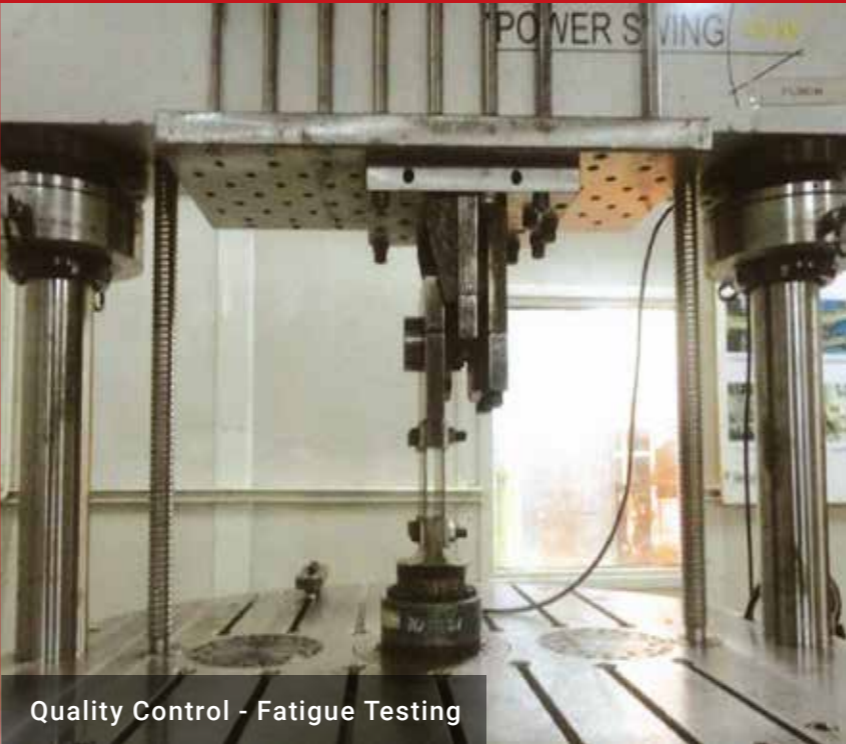
Quality Control - Fatigue Testing